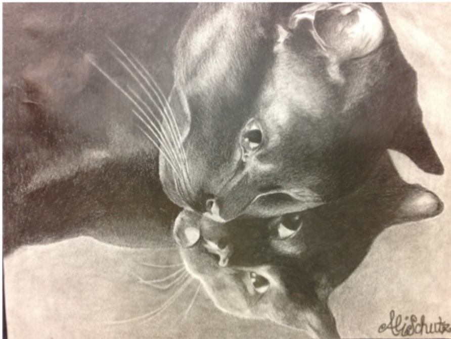
Ali Schutz, 2012

Student examples by WSR Drawing classes: