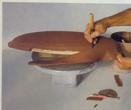
Use a fettling knife to trim the excess clay from the edge of the mold.