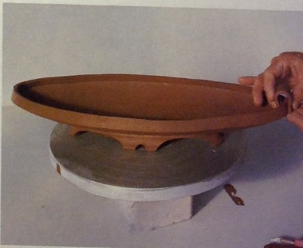
Roll or extruded handles are attached by scoring both the platter and the ends of the handles and using slip or vinegar.