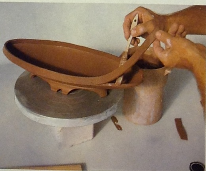
When the platter has dried enough to hold its shape and remove it from the mold, turn it over to work on the rim. An extruded or hand-rolled rim is attached to the rim by scoring both the platter and the rim and using slip or vinegar.