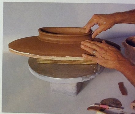
Add a foot by scoring both the bottom of the platter and the attached edge of the foot. Use slip or vinegar to attach the foot securely.