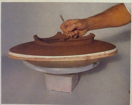
The foot is faceted using a knife.