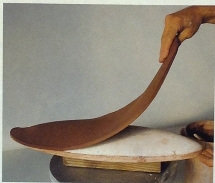
Place clay slab over the plaster mold.