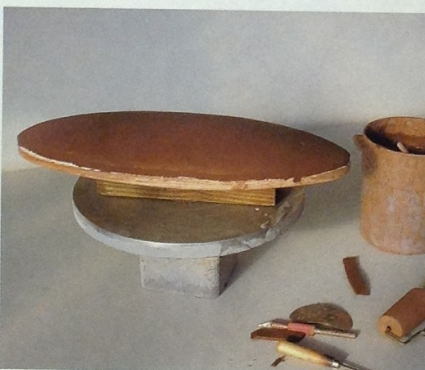
The platter is cut to the shape of the mold.