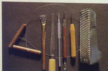
Wire cutter, large scoring tool, fettling knife, small scoring tool, lace tools, needle tool, and surform.