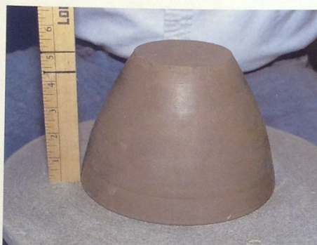
Marks on the ruler show the thickness of the base.