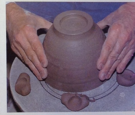
Remove the clay balls and check the pot for even thickness.