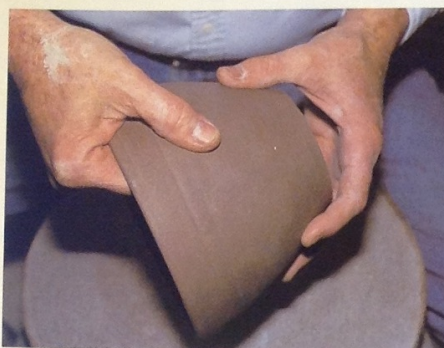
Feel sides for thickness.