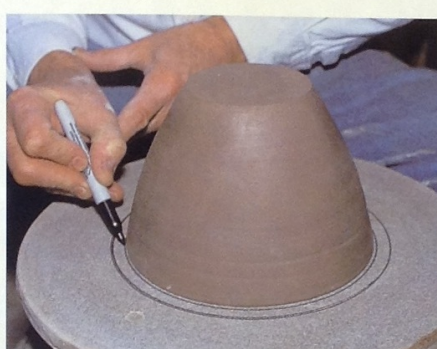
Mark the bat for centering. Turn the pot upside down on the bat.