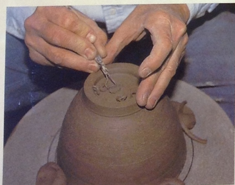
Remove the clay nipple using the loop tool.