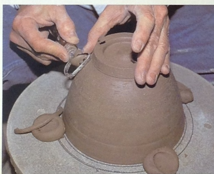
Trim the sides of the base using a loop tool. The wheel should be moving at slow to medium speed.