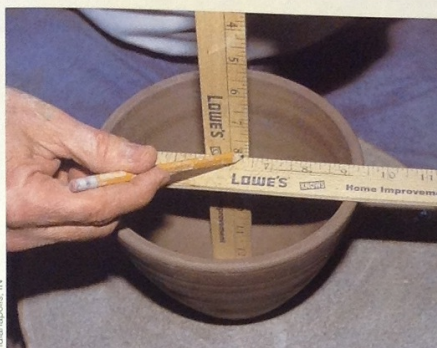
Mark inside height.