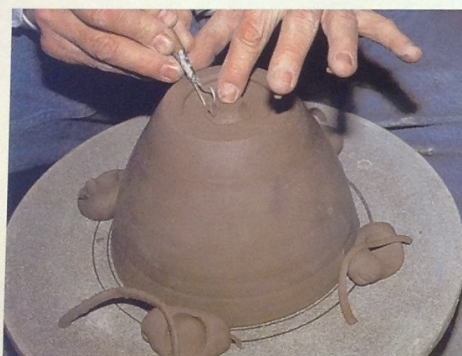
Trim the bottom using a loop tool, leaving a small center nipple of clay to check the depth of the base.