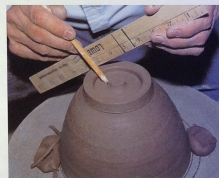
Check the depth of the trimming.