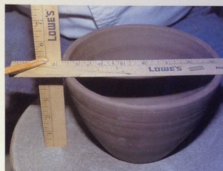
Mark outside height.