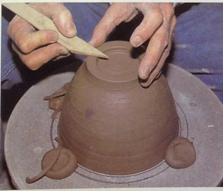
Smooth the foot with a wooden tool and your finger so that the bottom of the pot will not have any edges that might scratch after the piece is fired.